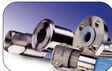
PTFE Lined Hose Assemblies