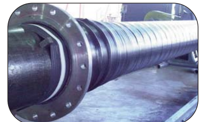
Custom Rubber Hand Built Hose Assemblies and Fittings

Our Quality System Is Registered & Certified To: