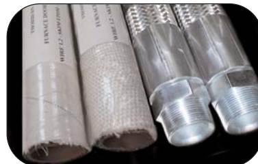
Conductive & Non-Conductive Furnace Door Hose Assemblies