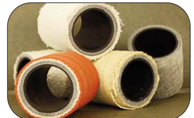
Nomex, Aramid, Fiberglass Jacketed Hose Assemblies