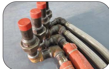
Flexible Piping Systems with Rigid Piping Connections