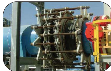
Rubber inline Pressure Balanced Expansion Joint