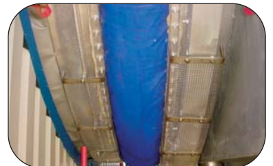
Flue Gas Corrosion Resistant Ducting Expansion Joint