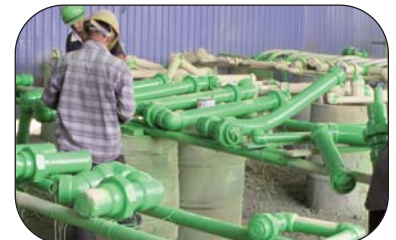
Rigid Piping Systems with Full Blasting & Painting Capabilities