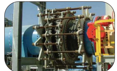
Rubber in-line Pressure Balanced Expansion Joint