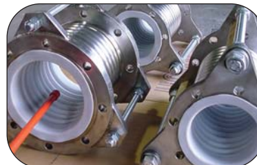
Metallic PTFE Lined Expansion Joint