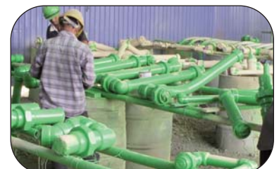
Rigid Piping Systems

Our Quality System Is Registered & Certified To: