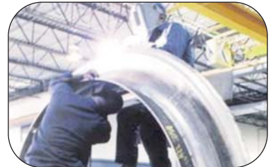
High Core Bellows Expansion Joint