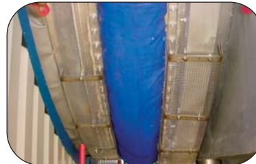
Flue Gas Corrosion Resistant Ducting Expansion Joint