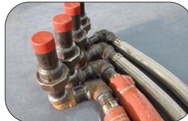
Flexible Piping Systems

Our Company is known by its products but our success is the result of our employees and partners combined capabilities, building value and working toward excellence to keep our customers satisfied.