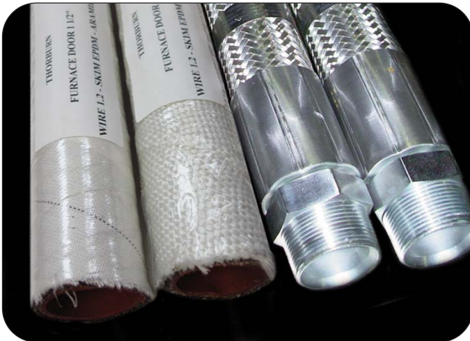
Conductive & Non-Conductive Furnace Door Hose Assemblies