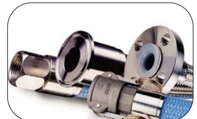
PTFE Lined Hose Assemblies

Our Company is known by its products but our success is the result of our employees and partners combined capabilities, building value and working toward excellence to keep our customers satisfied.