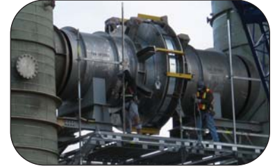
inline Pressure Balanced Expansion Joint