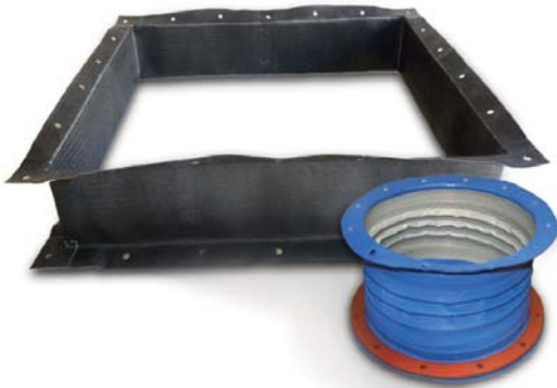
Thorburn's TLFP is the 1 st major improvement in the fluoroplastic industry in 40 years