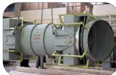
Main steam penetration gimbal expansion joints