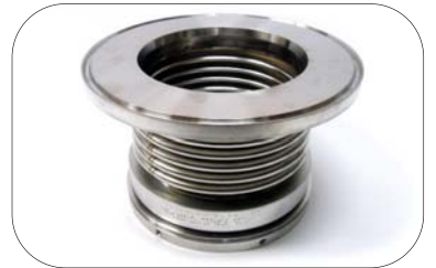
Loop liner tube bellows assemblies