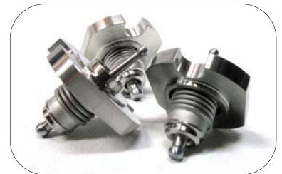
Bellows for snout indexing mechanism