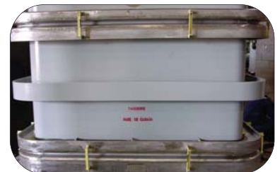
Containment passage rectangular expansion joints