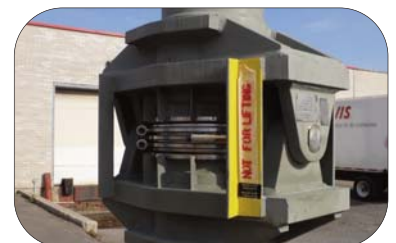
Dousing system hinged expansion joints