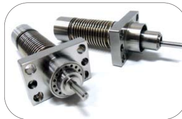
Fueling machine head separator assemblies