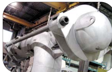
Pressure balanced crossover expansion joints