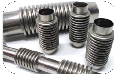
Miniature bellows for fuel rod flask limit switch & rod cup seal