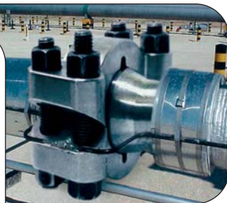
2500 psi steam piping system with Thorloc 316SS 4 inch connector