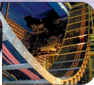
Thorburn hose assemblies on a CANDU catenary system