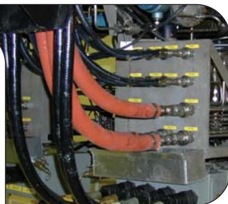
Thorburn quick couplings on a CANDU fueling machine