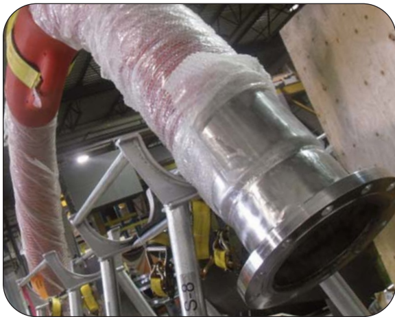
Swage Fitting to End Joints