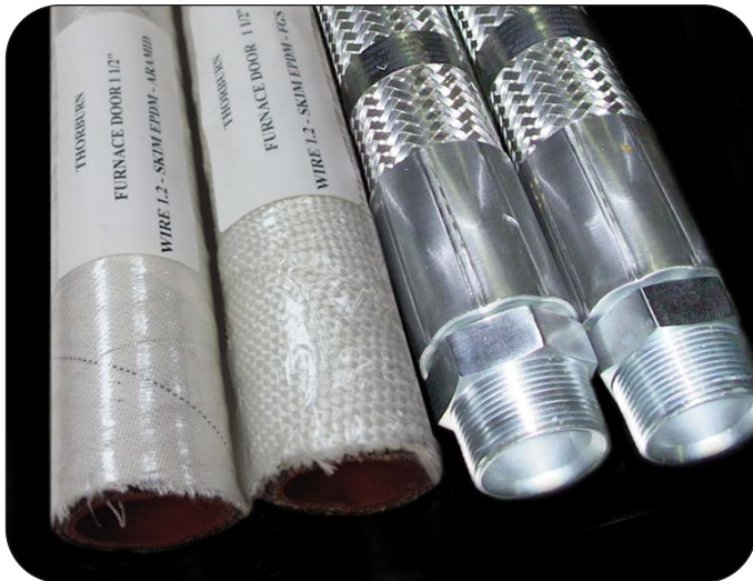
Conductive & Non-Conductive Furnace Door Hose Assemblies

Thorburn offers unmatched capabilities and expertise in applications, Engineering, Design and Manufacturing of leading end flexible piping and ducting systems. Targeting Thorburn's resources allows its core technology to be leveraged into hundreds of demanding applications.