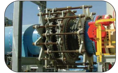
Rubber inline Pressure Balanced Expansion Joint