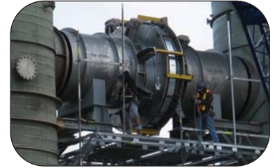
inline Pressure Balanced Expansion Joint