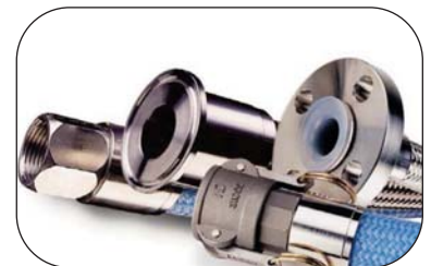
PTFE Lined Hose Assemblies