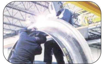
High Core Bellows Expansion Joint