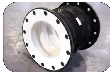
Rubber PTFE Lined Expansion Joint