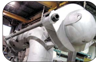
Elbow Pressure Balanced Expansion Joint