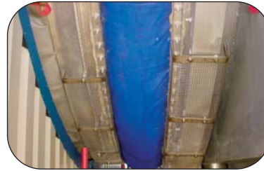
Flue Gas Corrosion Resistant Ducting Expansion Joint